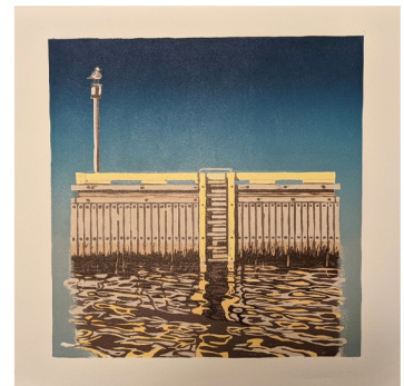
Chris Batten's "Shelter from the Storm" reduction woodcut.

Woodcut is the one of oldest forms of printmaking. It is a relief process in which hand carving tools are used to cut into a wooden block's surface. After the the block has been cut, the raised areas are inked and printed, while the cut away areas that do not retain ink and will remain blank during the printing process.